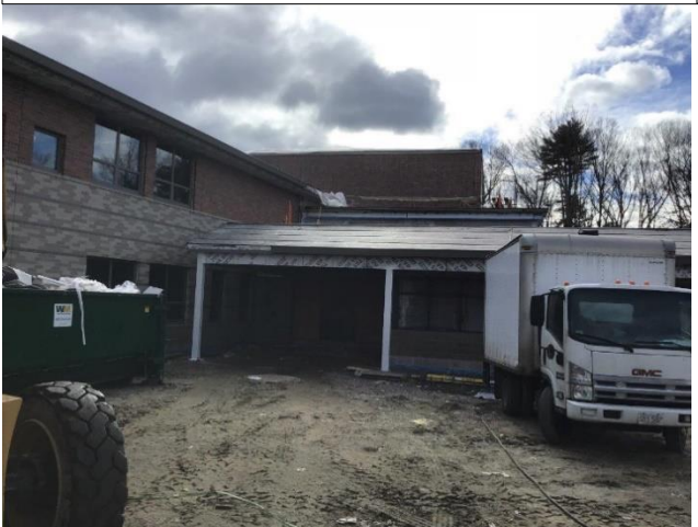
Completed Masonry at Main Entrance