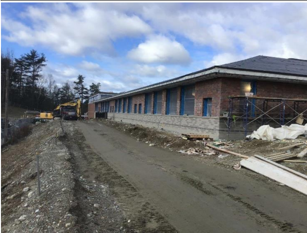
Completed Masonry on South Side of D Wing