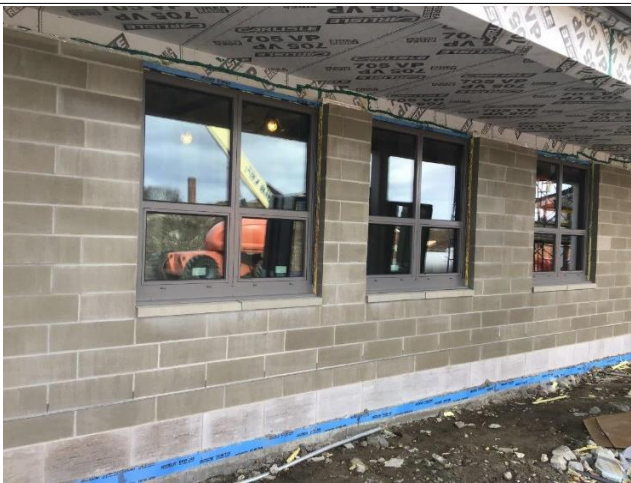
Exterior Masonry and Windows at Main Entrance