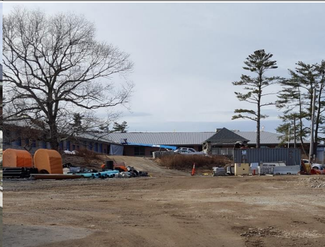
Another Roof View