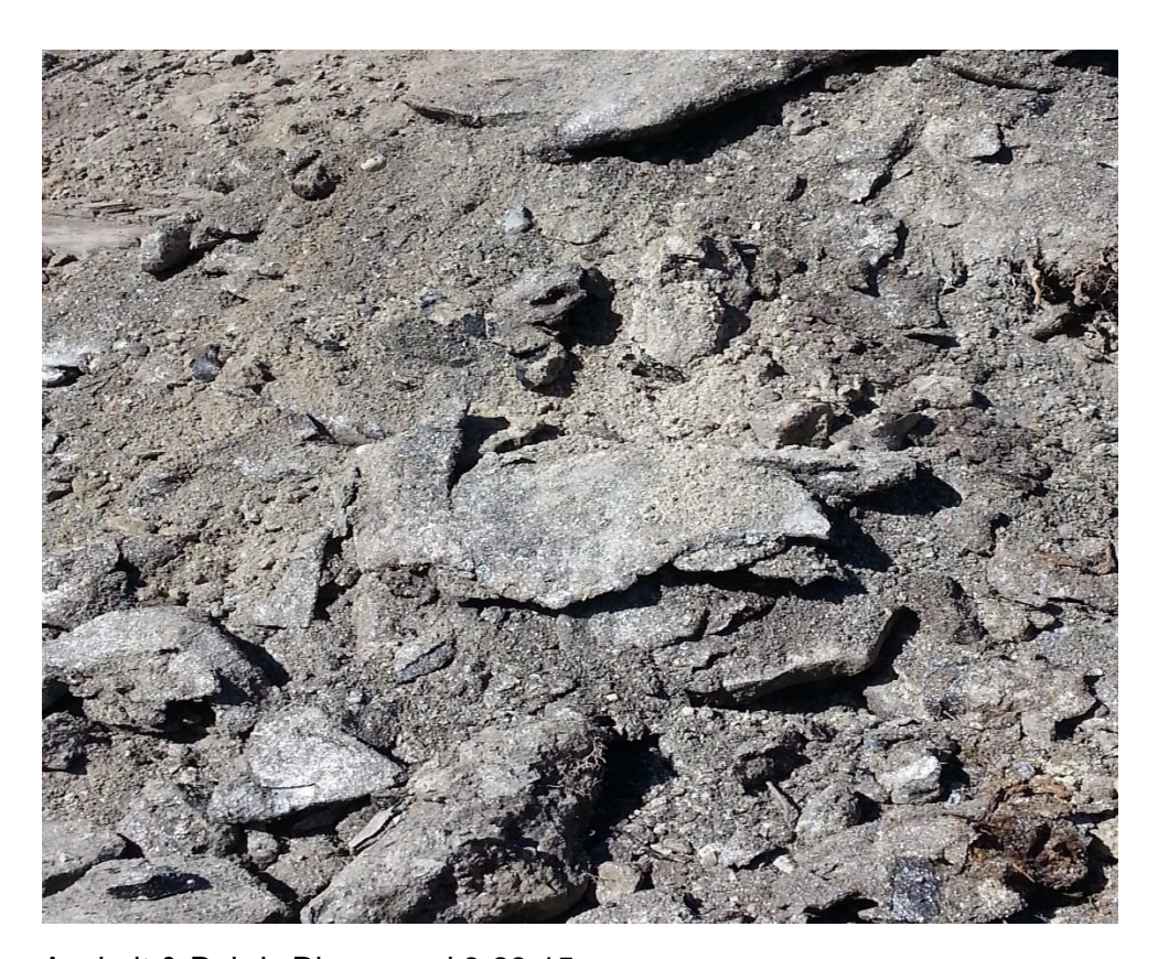
Asphalt & Debris Discovered 8-28-15