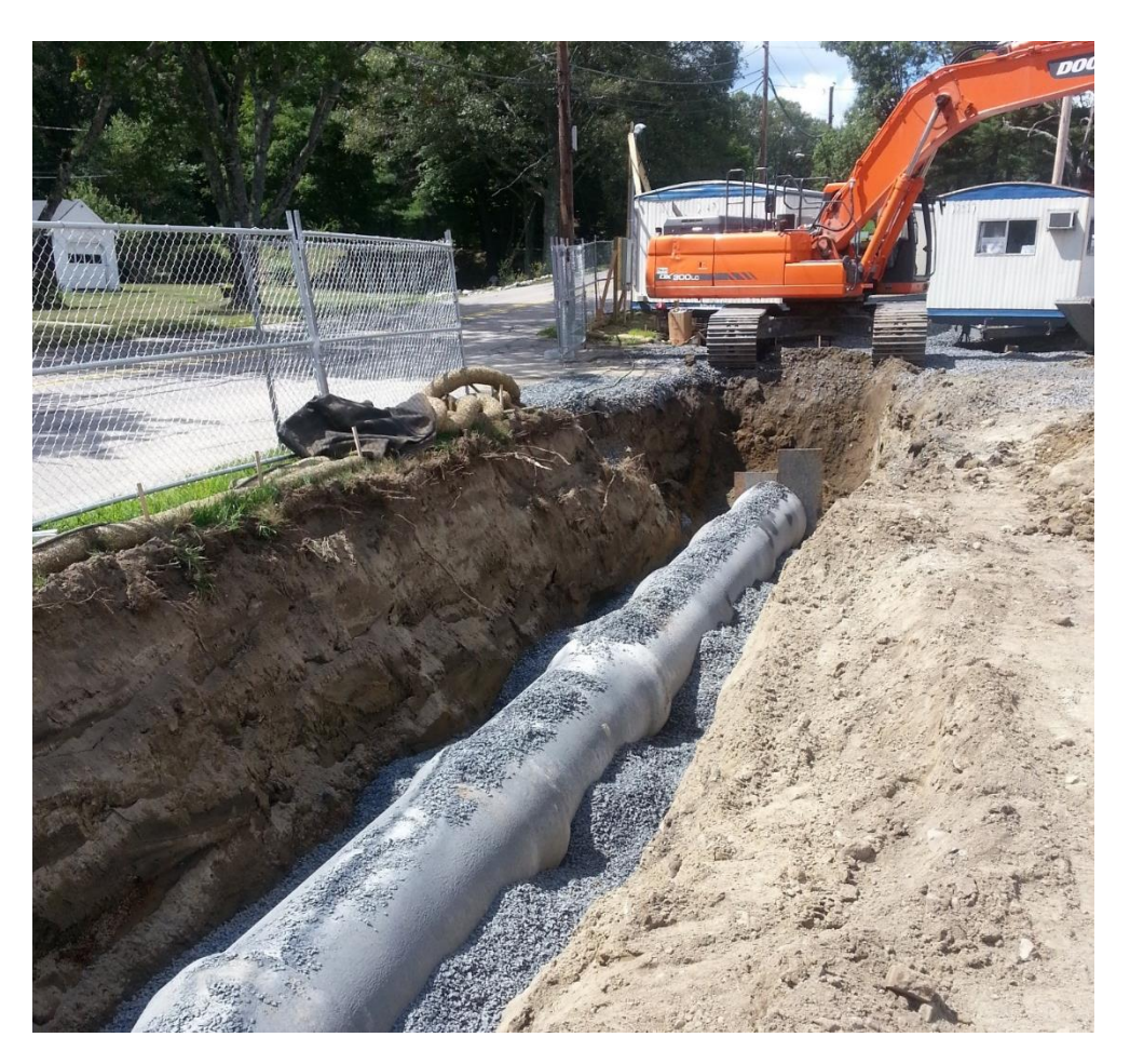
New 30" Drainline installation 8-10-15