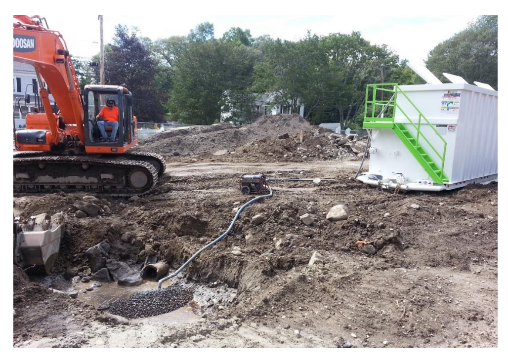
Second Mobilization to Remove Contaminated Soils 8-21-15