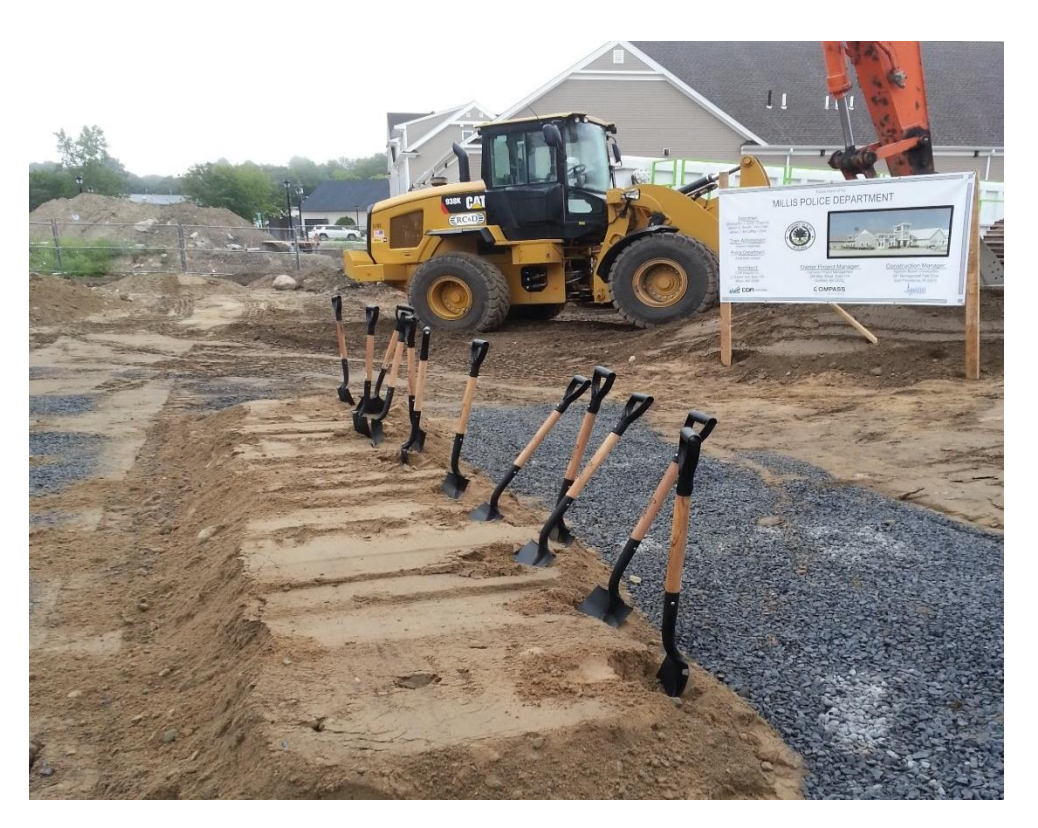
Prelude to Groundbreaking Ceremony 8-24-15