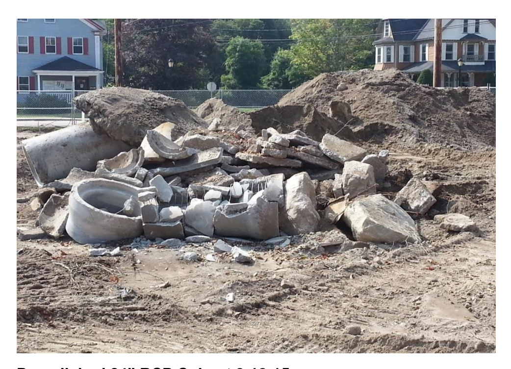
Demolished 24" RCP Culvert 8-18-15