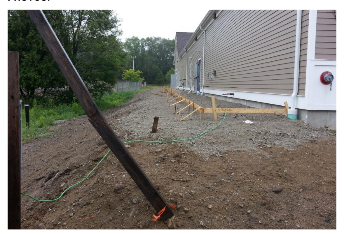
JOPA Property showing encroachment 6-01-15