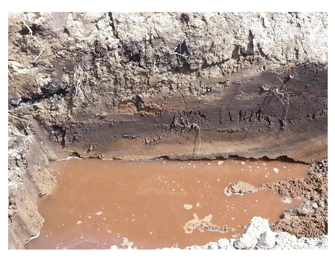
Organic layer discovered 7-31-15