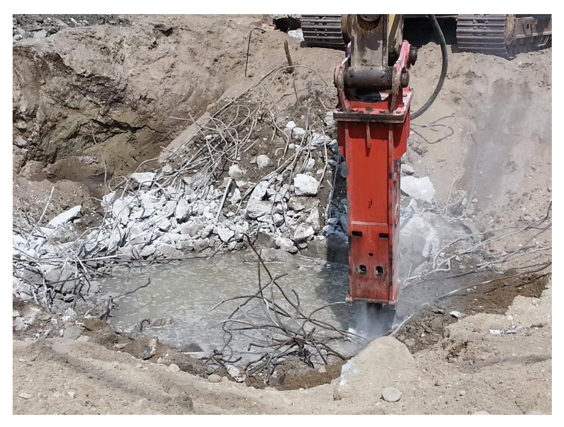
Hoe-ramming existing concrete foundation at old sewer station 7-28-15