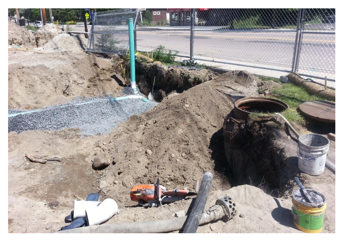
Sewer tie-in to SMH at front yard 7-31-15