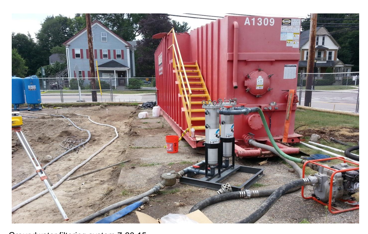
Groundwater filtering system 7-30-15