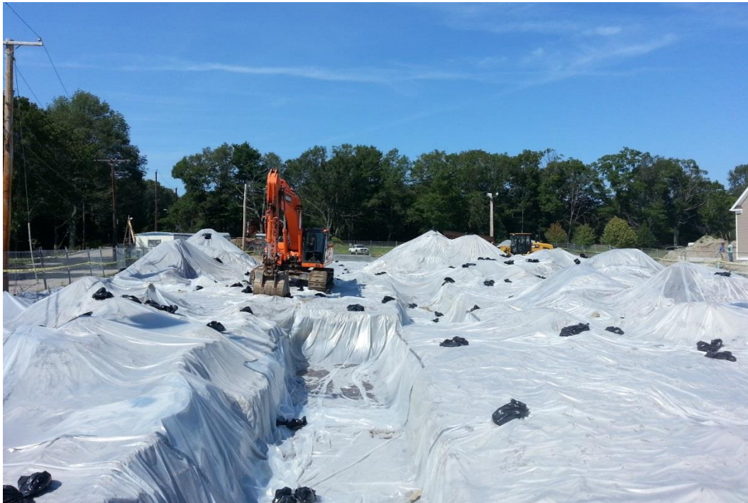
STATE of the PROJECT as of 10-28-15