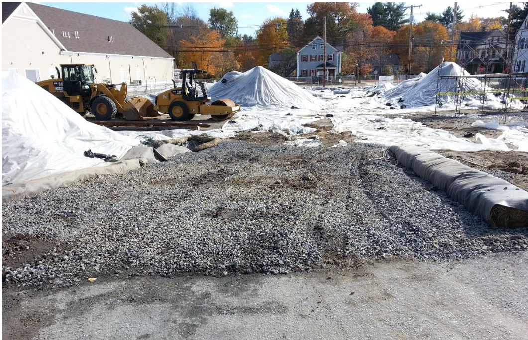
TRUCK WASH AREA 10-29-15