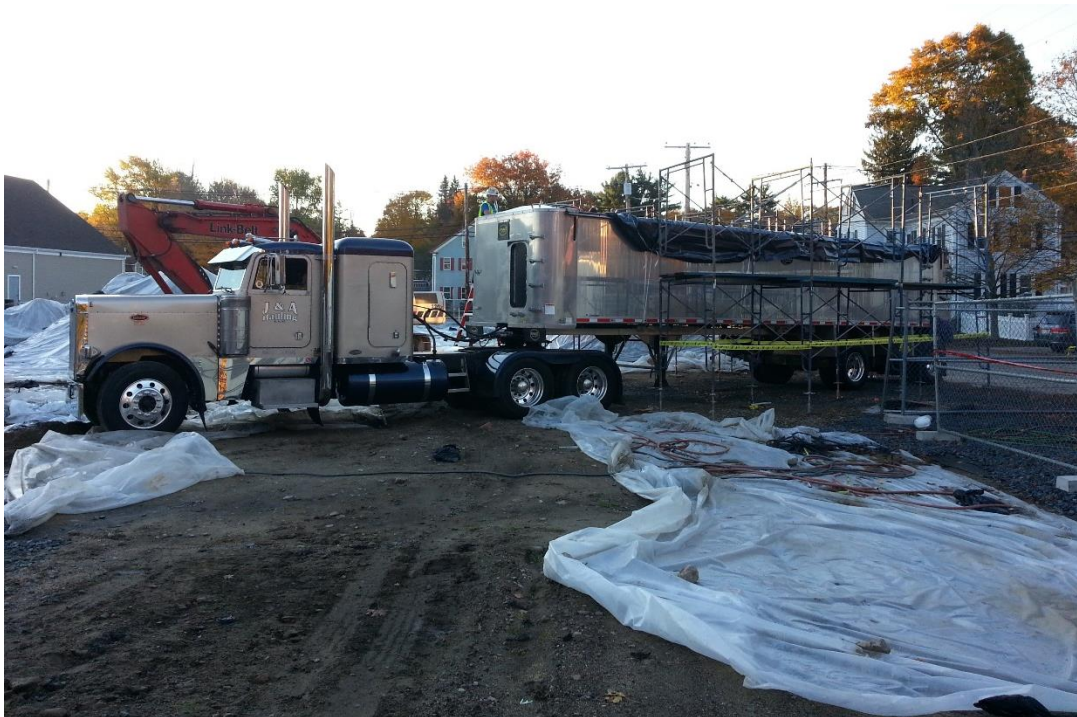
TRUCK PREP & LINER 10-29-15