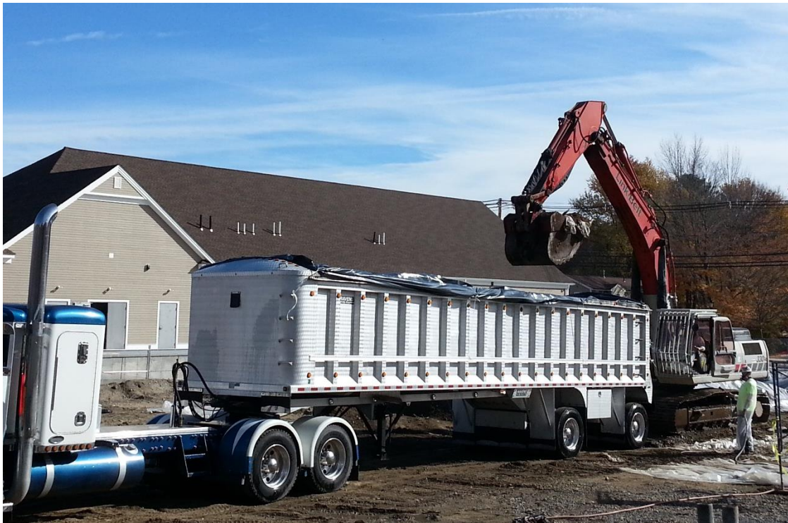
LOADING CONTAMINATED MATERIALS 10-30-15