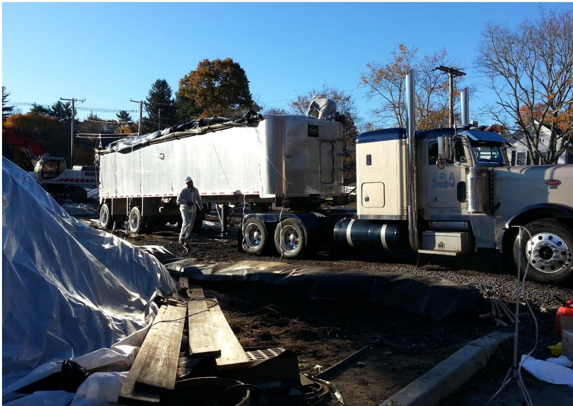
SEALING LOAD & TRUCK WASHING 10-30-15