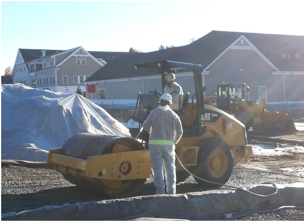
DECON of EQUIPMENT 10-29-15